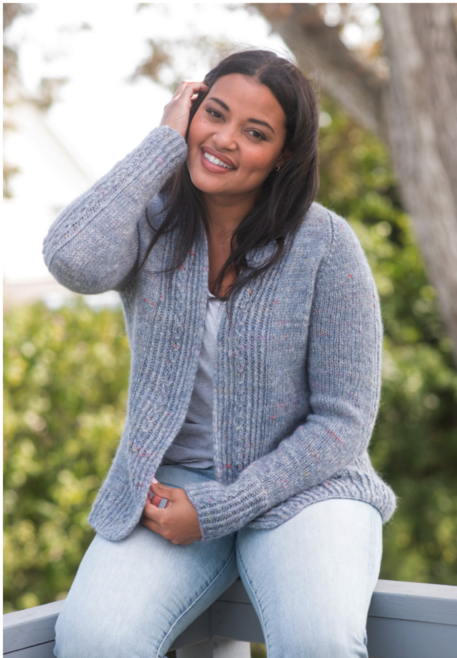
Shown with Glarna

Designed by Alison Green / Skill level: Intermediate